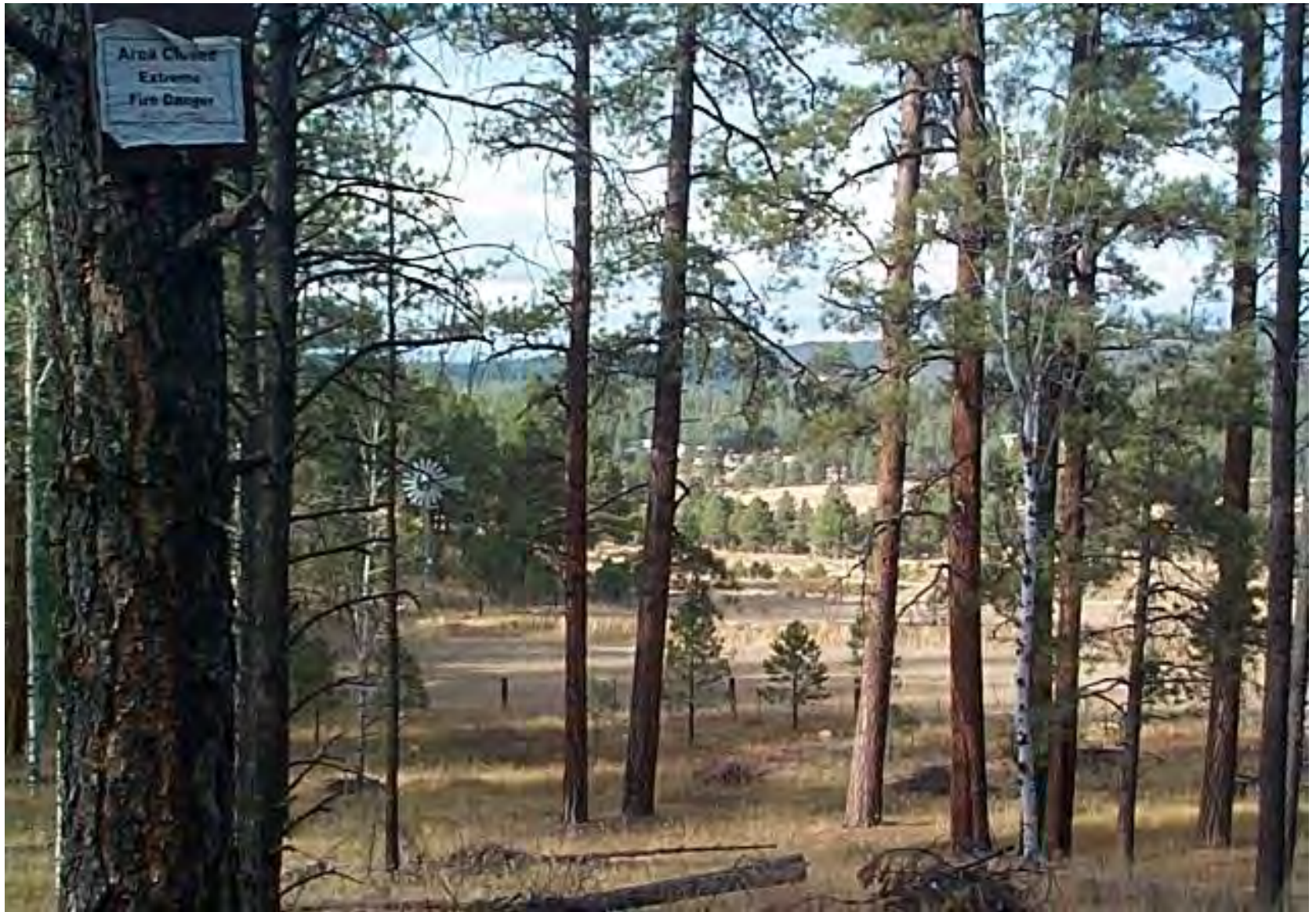
Greater Eastern Jemez Wildland/Urban Interface