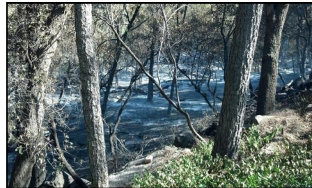
Effective use of defensible space created by a landowner.

conditions, and effective use of “burnouts” allowed for no loss of life or property, no major injuries, and more than half of the fire falling into low severity or unburned categories according to the Burn Severity Reflectance Classification. Crews effectively mitigated fire intensity during “burnout” operations and much of the low severity fire is on top of the rim within the burnout areas. Not only were they able to contain the fire, but the areas that saw low intensity fire will be healthier and residents will be safer in the long run. Fire managers took full advantage of the opportunity to use fire that is beneficial while working within the parameters of safety, property and natural resource protection during this suppression event.