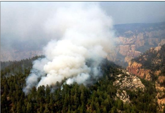
Ariel view of the Slide Fire.

The Slide Fire could have been much more damaging, but pre-planning, forest thinning treatments, weather