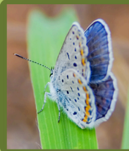
Karner Blue Butterfly

These insects from the genus Melanophila fly towards fires. They can travel over 50 miles. Unlike most animals that try to escape fire, they depend on burned trees for habitat. When they arrive they lay their eggs under the bark of fire damaged trees. The insect can sense heat using infrared sensors in their thorax.