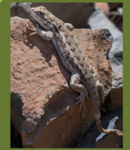
Western Fence Lizard

This endangered insect with blue wings is found in a small area in North America near the Great Lakes. They only lay their eggs on wild blue lupines, which is the food for their caterpillars. Wild blue lupines grow best in areas that have been cleared by wildland fires. Without fires these insects don't have food.