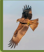
Australian Black Kite

This long-legged grazing mammal lives in the grasslands and steppes of the Western United States. They depend on fires to burn dry grass and shrubs and allow new, green grass to grow. They are fast, running at speeds up to 60 miles per hour. They can usually outrun fires that burn through their habitat.