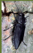
Fire Chaser Beetle

These large grazing mammals live in the mountains and high elevation grasslands of North America. They are usually able to outrun fires. They return to burned areas as the land recovers. These mammals like to eat the grasses and plants that sprout as plants regrow.