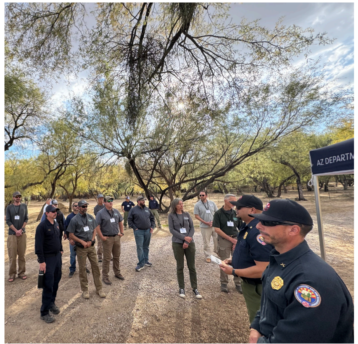
Partnering with the Arizona Department of Forestry and Fire Management to learn from fire prevention staff during the 2024 AZ Wildland Urban Fire Summit.

Beyond publications, the investment enabled deeper community impact. Over 6,400 participants attended in-person events. More than 19,000 subscribers engaged through newsletters. SWFSC helped train over 16,000 youth via its fire ecology curriculum and provided $43,000 in workforce support through travel scholarships. By empowering professionals and connecting communities with actionable science, SWFSC turned strategic funding into a measurable, statewide impact—proving that smart investments deliver real returns for Arizona and the Southwest Region. 🌱